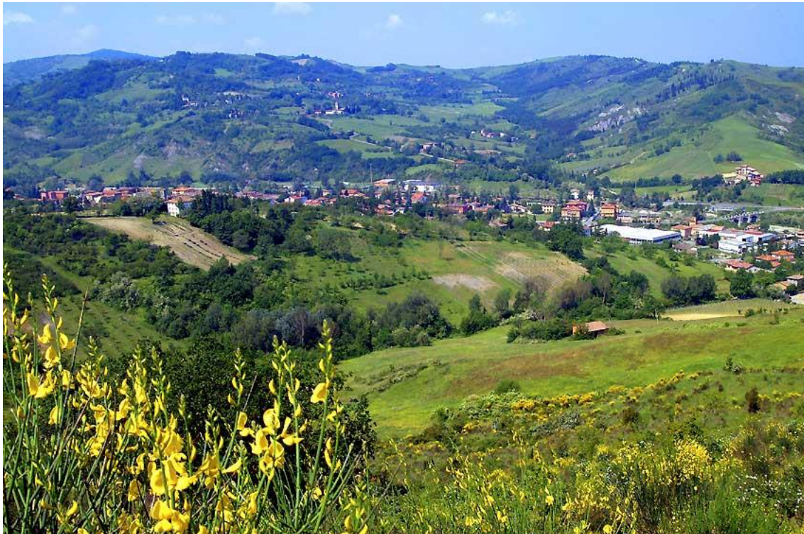
The rolling hills south-west of Bologna, perfect for truffle hunting